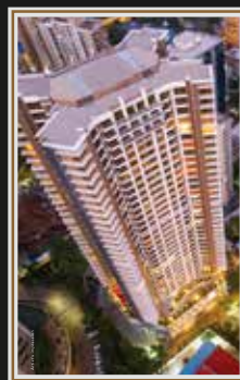
Transcon Triumph T1 Andheri West