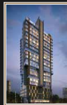
Westbay Bandra West