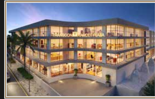
Ramdev Plaza Santacruz West