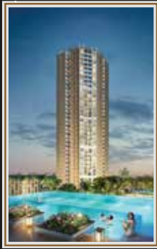
Transcon Triumph T4 Andheri West