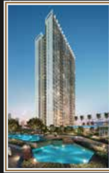
Transcon Triumph T2 Andheri West