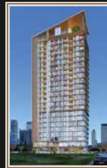
Silverbay Bandra West