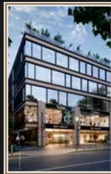
YURA Juhu Circle