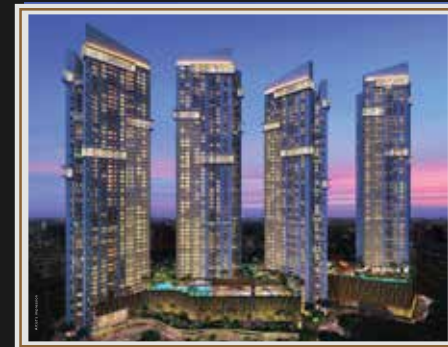
Auris Serenity Malad West