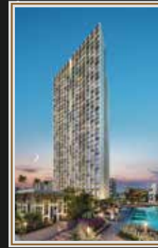
Transcon Triumph T3 Andheri West