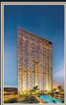
Tirumala Habitats Mulund West